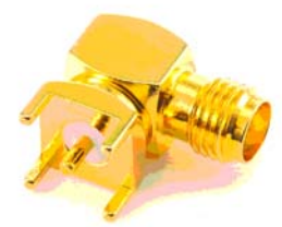
(Series Image-Reference Only)