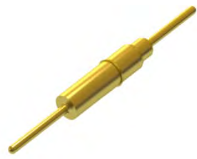
(Series Image-Reference Only)